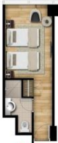
SAVOY HOTEL MAGTAN NEWTOWN TWIN SUITE A= 23.00 M 2