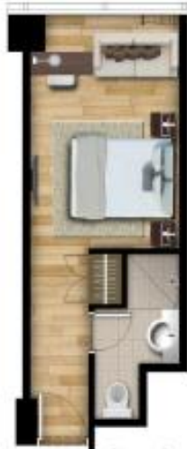
SAVOY HOTEL HACTAN NEWTOWN QUEEN SUITE A= 23.00 M 2

3RD FLOOR = UNITS 301,303,315,317,319 4TH FLOOR = UNITS 402,404,408,411,415,417,428,430,432 5TH FLOOR = UNITS 502,504,508,511,515,517,528,530,532 6TH FLOOR = UNITS 602,604,608,611,615,617,628,630,632 7TH FLOOR = UNITS 702,704,708,711,715,717,728,730,732 8TH FLOOR = UNITS 802,804,808,811,815,817,828,830,832 9TH FLOOR = UNITS 902,904,908,911,915,917,928,930,932 10TH FLOOR = UNITS 1002,1004,1008,1011,1015,1017,1028,1030,1032 11TH FLOOR = UNITS 1102,1104,1108,1111,1115,1117,1128,1130,1132 12TH FLOOR = UNITS 1202,1204,1208,1211,1215,1217,1228,1230,1232 14TH FLOOR = UNITS 1402,1404,1408,1411,1415,1417,1428,1430,1432 15TH FLOOR = UNITS 1502,1504,1508,1511,1515,1517,1528,1530,1532 16TH FLOOR = UNITS 1602,1604,1608,1611,1615,1617,1628,1630,1632 17TH FLOOR = UNITS 1702,1704,1708,1711,1715,1717,1723,1732 18TH FLOOR = UNITS 1802,1804,1808,1811,1815,1817,1823,1832